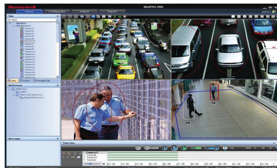
MAXPRO VMS Client Viewer 2x2

MAXPRO VMS is ideal for facilities requiring at-risk critical infrastructure protection such as airports, seaports, large multi-site commercial buildings, casinos, and other high-profile facilities. It is the perfect client-server video management solution for locations requiring the use of both digital and analog technologies.