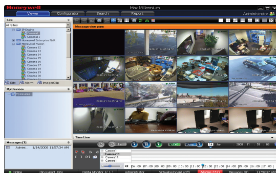
MAXPRO VMS Client Viewer 4x4

MAXPRO VMS is highly scalable so users can easily expand their video surveillance network from small to medium single instances to enterprise level supporting thousands of devices. Additionally, MAXPRO VMS includes integration with Honeywell's Pro-Watch® security management system, Active Alert® and People Counter video analytics, as well as other Honeywell products and solutions. The feature-rich user interface truly offers a unified management platform across many disparate systems to further embody Honeywell's concept of "Learn One, Know Them All."